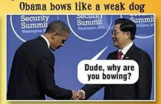
Obama... W T F ?!