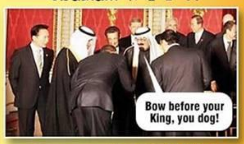
Obama... W T F ?!!!!!!