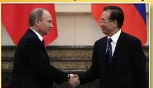
Putin looks the Saudi King in the eye