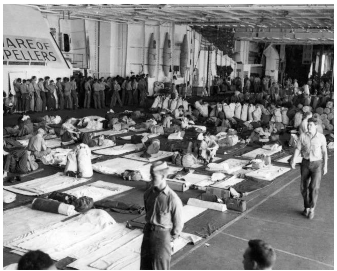
Hangar of the USS Wasp during the operation.

There was enormous pressure on the operation to bring home as many men as possible by Christmas 1945.