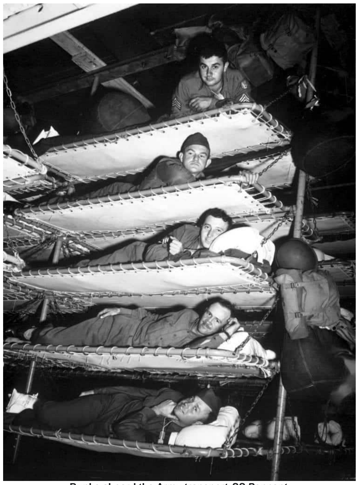
Bunks aboard the Army transport SS Pennant.

The Navy wasn't picky, though: cruisers, battleships, hospital ships, even LSTs (Landing Ship, Tank) were packed full of men yearning for home.