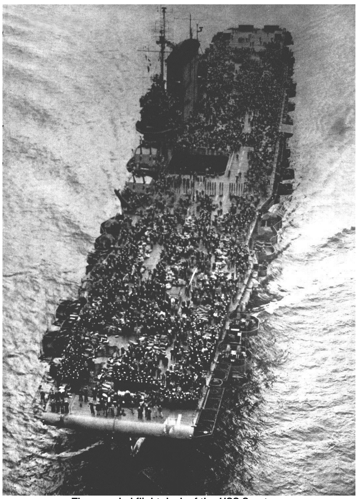
The crowded flight deck of the USS Saratoga.