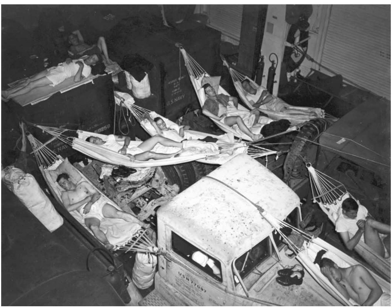
Hammocks crammed into available spaces aboard the USS Intrepid. In October 1945, with the war in Asia also over, the Navy started chipping in, converting all available vessels to transport duty.

On smaller ships like destroyers, capable of carrying perhaps 300 men, soldiers were told to hang their hammocks in whatever nook and cranny they could find.