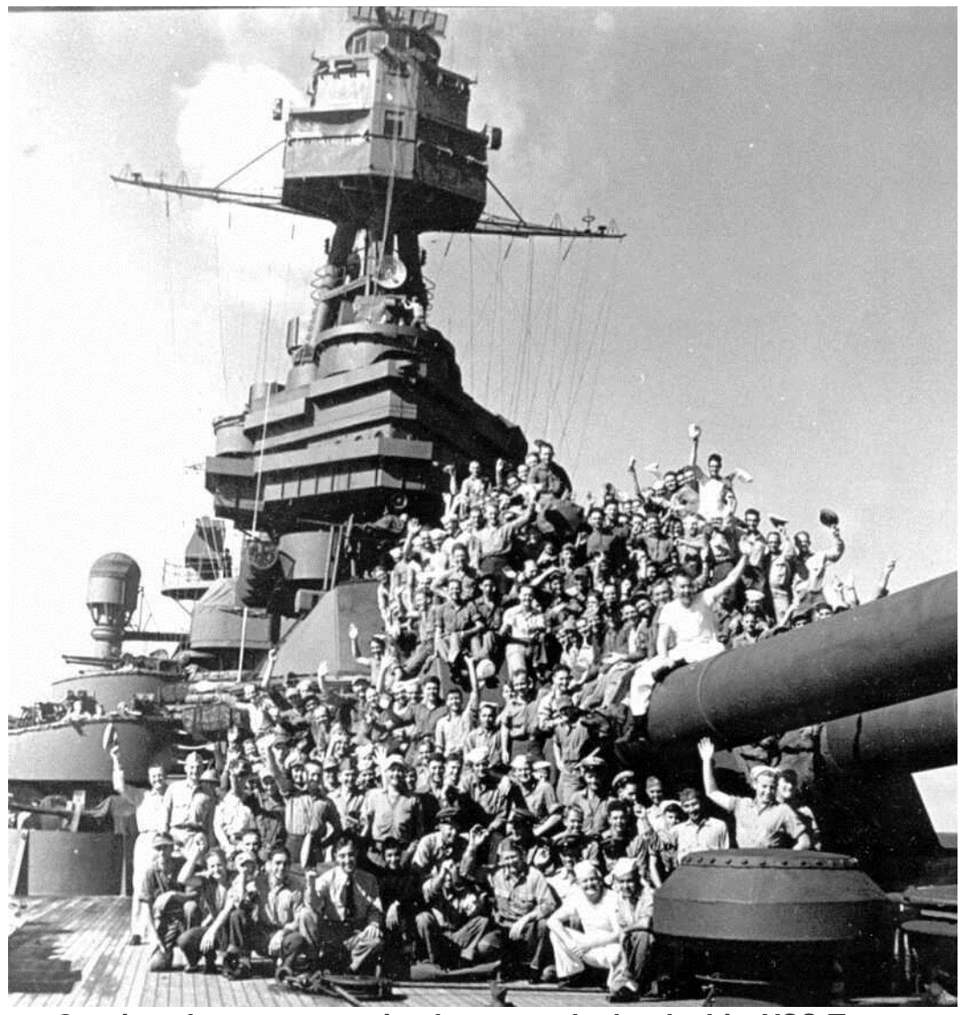
Overjoyed troops returning home on the battleship USS Texas.

A Los Angeles taxi driver took six soldiers all the way to Chicago; another took another carload of men to Manhattan, the Bronx, Pittsburgh, Long Island, Buffalo and New Hampshire. Neither of the drivers accepted a fare beyond the cost of gas.