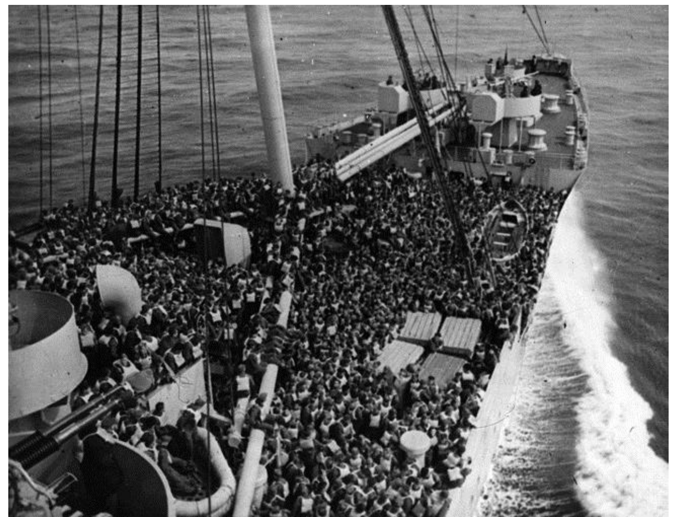
Troops performing a lifeboat drill onboard the Queen Mary in December 1944, before Operation Magic Carpet .

Twenty-nine ships were dedicated to transporting war brides: women married to American soldiers during the war.