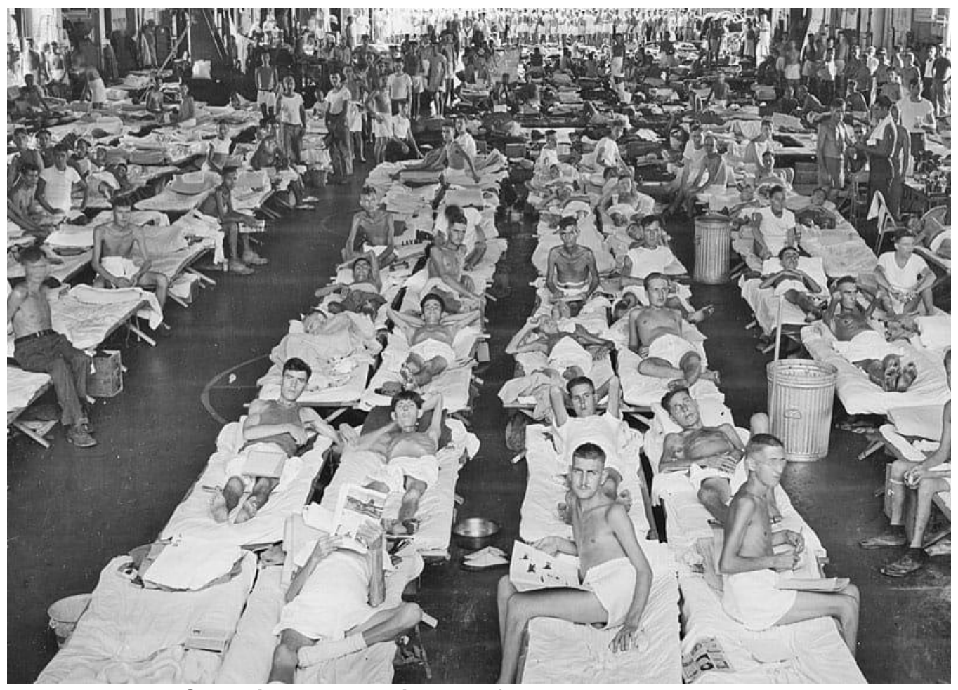
U.S. soldiers recently liberated from Japanese POW camps.

The transports carrying them also had to collect numerous POWs from recently liberated Japanese camps, many of whom suffered from malnutrition and illness.